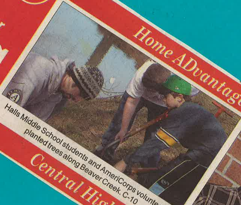
Halls Middle School students and AmeriCorps volunteers planted trees along Beaver Creek. C-10